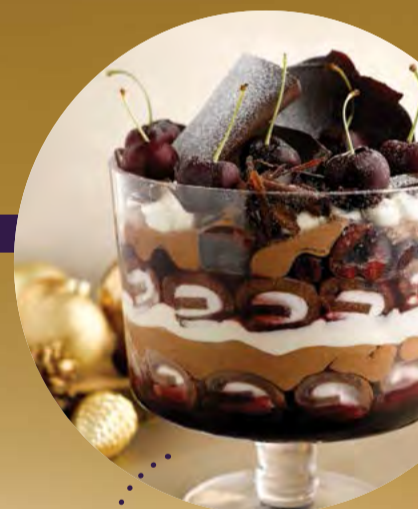
A dark and delicious Black Cherry Trifle

$78 (A) Inclusive of a glass of champagne $128 (A) Inclusive of free flow wine, beer and champagne $42 (C) Inclusive of free flow soft drinks and juices